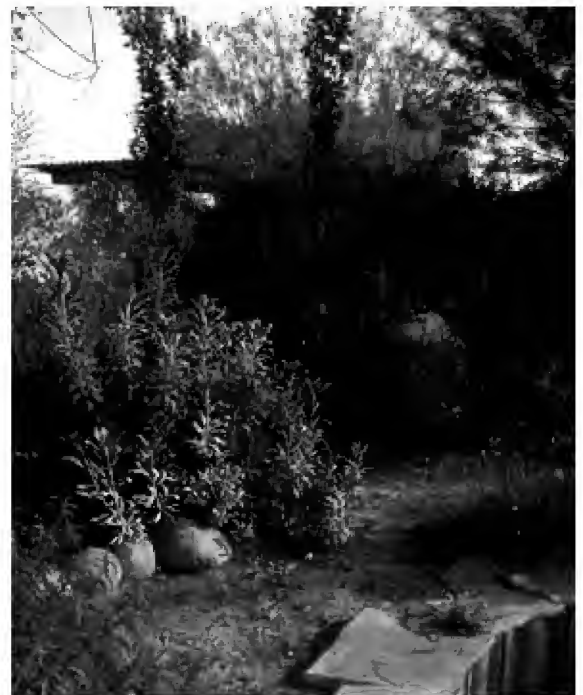
Sages, oaks and mesquite, showing their colors.

providing shelter and blooms. The Cleveland sages have a handful of blue blooms here and there. The Valley oak's leaves are still green, but the Crimson Spire™ oaks have turned a reddish brown. So although the seasons are changing, the garden still has color and butterflies — although not as many — and of course